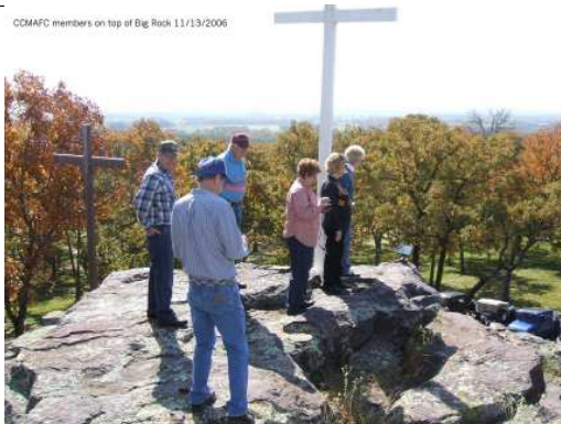
CCMAFC members on top of Big Rock 11/13/2006