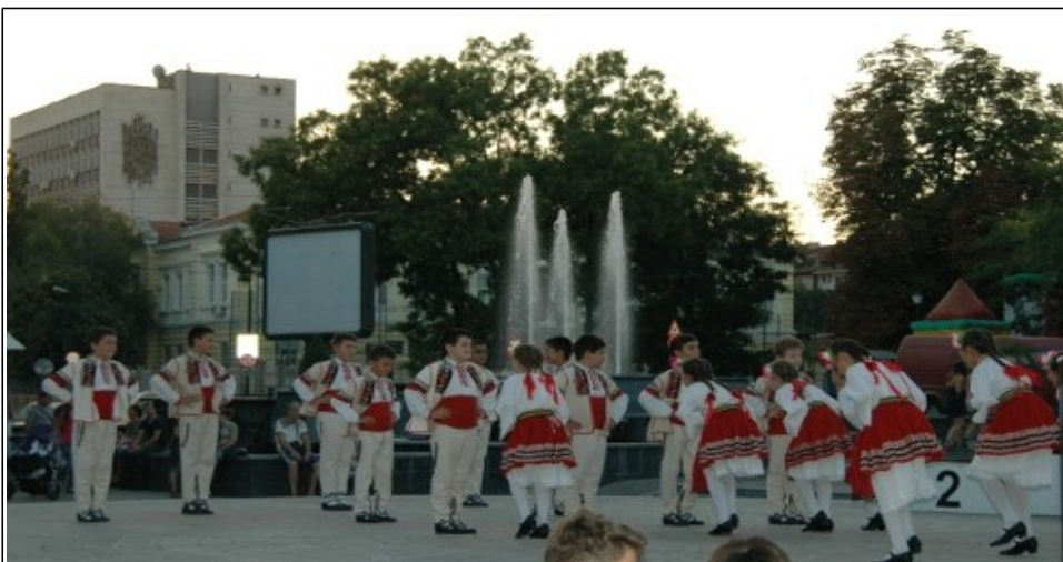
Closing ceremonies Pazardzhik, Bulgaria

OCT 26-28, 2012 -- Autumn Trails - Winnsboro - Stew supper on Friday night, large parade Saturday morning, tour through countryside Sunday morning. Swap meet all weekend. Always a great weekend.