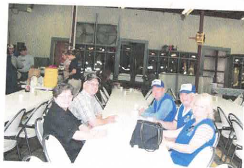
Breakfast at Emory