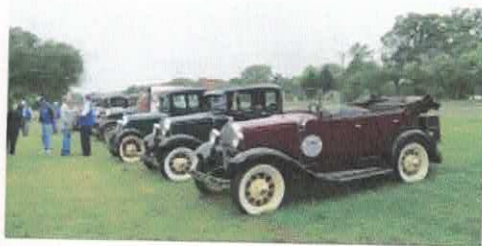
A's at Care Center