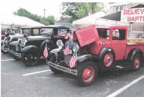
Judy's Favorite Truck