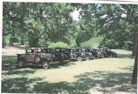
A's at Picnic at Powells