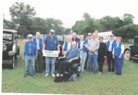
Malakoff Care Center